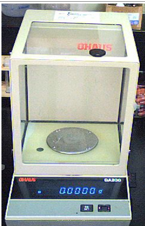
Illustration 1 - A typical analytical balance

For measuring mass, our laboratory is equipped with analytical balances . The analytical balance is a high-quality instrument capable of measuring masses with both high accuracy (correctness) and high precision (reproducibility). The trade-off is that you cannot typically weigh large masses on an analytical balance.