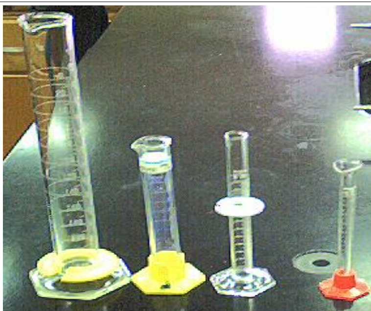
Illustration 3 - Graduated cylinders in several colors and sizes

One of the most common volume measurement devices in the chemistry laboratory is the graduated cylinder - simply a glass cylinder printed with a scale.