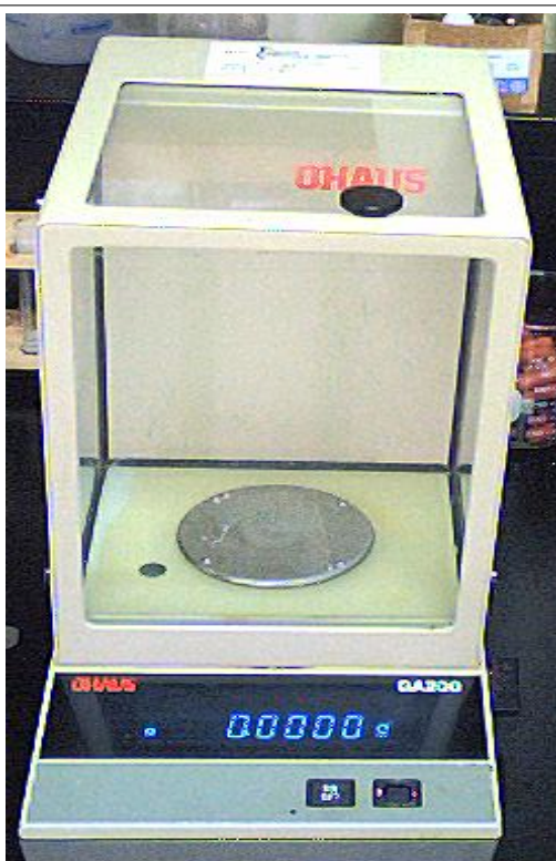
Illustration 1 - A typical analytical balance

For measuring mass, our laboratory is equipped with analytical balances . The analytical balance is a high-quality instrument capable of measuring masses with both high accuracy (correctness) and high precision (reproducibility). The trade-off is that you cannot typically weigh large masses on an analytical balance.